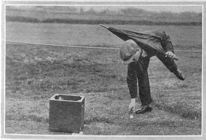
REPLACING BALL PICKED UP IN ERROR: A CADDIE PICKED UP MR. TULLOCH'S BALL, WHICH WAS DRIVEN TO THE SECOND TEE.